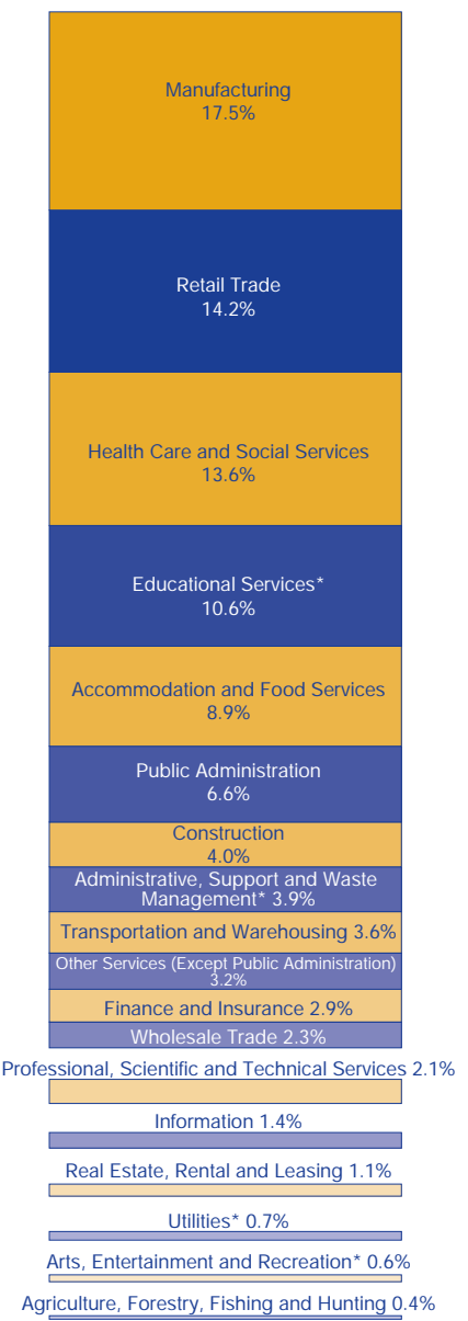
FIGURE 2: INDUSTRY DISTRIBUTION

Management of Companies and Enterprises* 0.2%