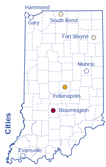
Note: Legend for each state map is the same as the legend for the United States map in Figure 1.